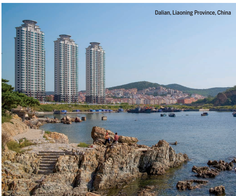
Dalian, Liaoning Province, China